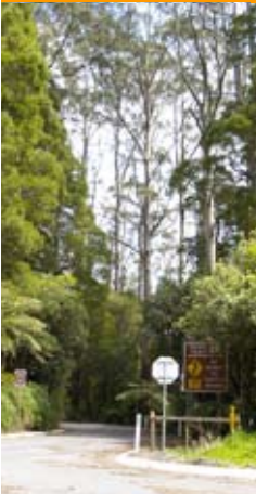
The Colac-Apollo Bay summer bus provides affordable travel over the summer holidays.

The Colac-Apollo Bay summer bus offers air conditioned travel in a comfortable 33 seater bus with luggage and surfboard storage. Book the bus bike trailer 24 hours ahead so you can bike ride around scenic Lake Elizabeth, Forrest mountain bike trail or Stevenson's Falls.