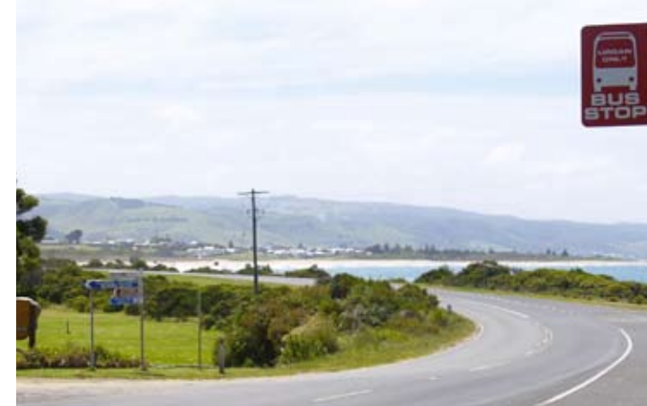
The Great Ocean Walk bus stop, looking towards Apollo Bay

A Transport Connections Project Bringing Communities Together