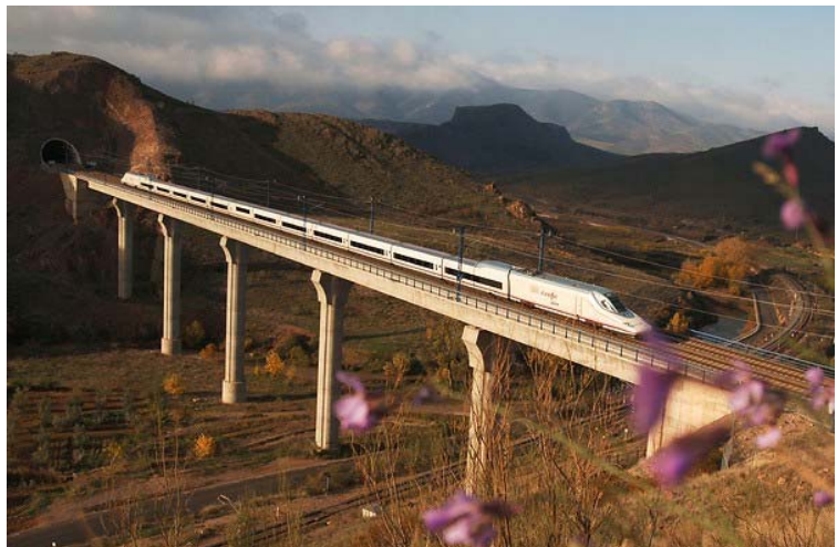
An AVE Train in Spain