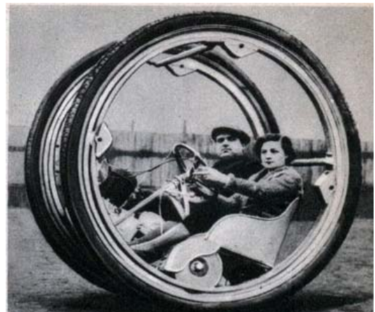
Gyro-Wheel Car Modern Mechanix, 1935

Ref: Victor Violante, Canberra Times, 28/10/09